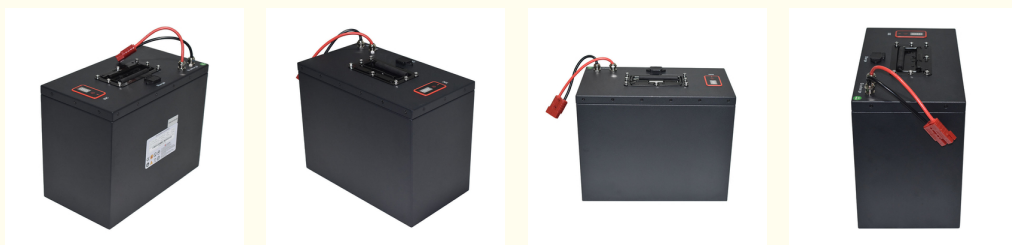
Lithium Ion LiFePO4 Solar 12V 12.8V 100Ah Portable Solar