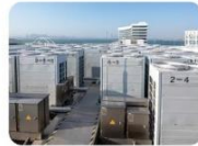
communication base station energy storage