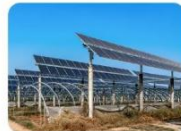
Industrial energy storage