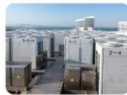
communication base station energy storage