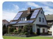
Home energy storage