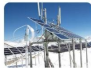
Mountain communication base station