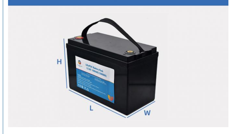
Key Features of Pinsheng Energy Battery: